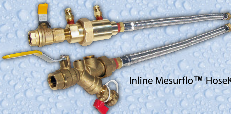
Inline Mesurflo™ HoseKit

HoseKits are a convenient method of combining the advantages of flow control and a flexible connection. Our kits are supplied with a Mesurflo™ Automatic Balancing valve, a non-ported ball valve, two stainless steel braided hoses, and a ball valve with P/T ports. All kits are 100% leak tested before shipping!