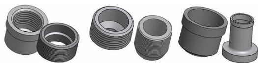
Threaded Connection Threaded Ultra High Approved Solder Connection

*For specific dimensions, or information about other types of connections, please contact your SWEP sales representative.