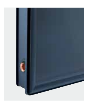
Collector frame with special roof integration profile for fitting the covering frame

The flat-plate collectors are universally suitable for on-roof installation, roof integration and freestanding installation in locations such as flat roofs. The easy-to- install Viessmann fixing system comprises structurally tested, corrosion-resistant components made of stainless steel and aluminum.