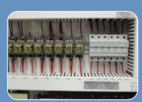
ISOLATION RELAYS Protect the PLC from damage on device power up surges and faults.