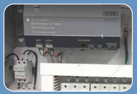
OPTIONAL BACK UP POWER SUPPLY Allows default positioning and controlled switching on power failure.