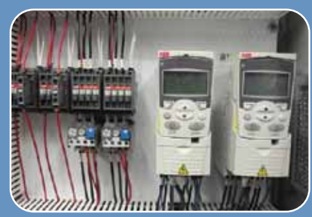
VARIABLE FREQUENCY DRIVES Enhances pump performance and saves energy. Output pump pressure (PSI) is set on touch screen.