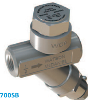
TD700SB Strainer & Blowdown Valve