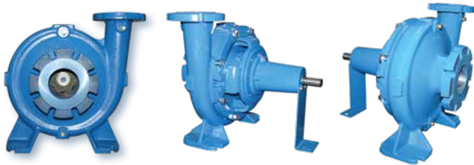
WEINMAN 375/575 END SUCTION

All of these products by CRANE Pumps & Systems are certified to NSF standards.